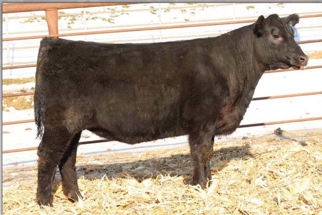
Meadow Lawn Rita 943-4128