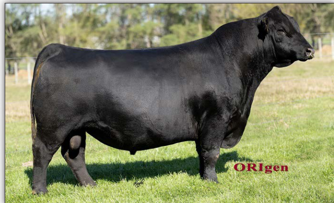
Crouch Congress - Sire of Lot 9

• Ranks in the top 2% for $M; top 20% for HP and MARB.