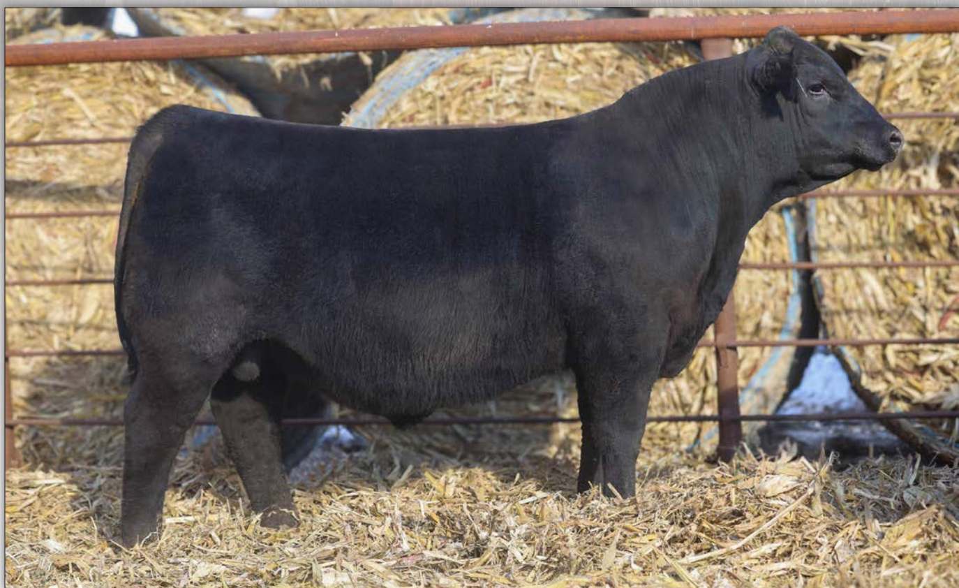
Meadow Lawn Doc Holiday 4106