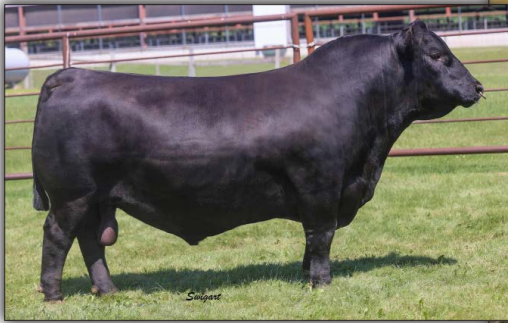
Symmetry 228 - Sire of Lots 3-6