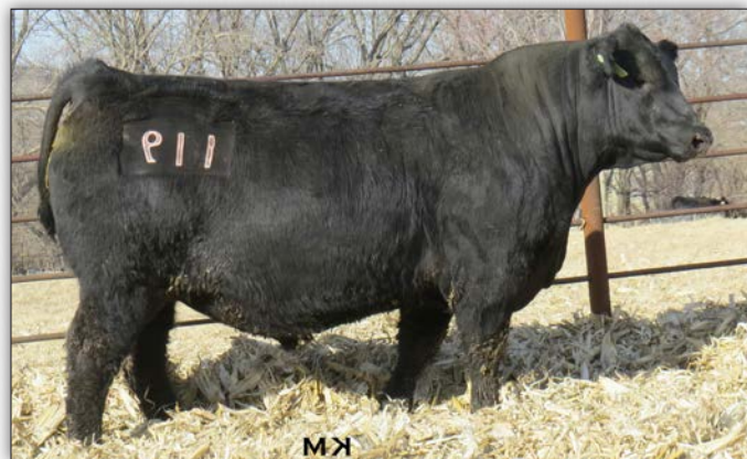
KM Blue Diamond 119 - Sire of Lots 29-37

• Ranks in the top 3% for SC; top 4% for PAP; top 10% for BW.