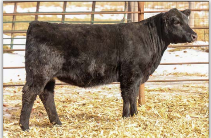
Meadow Lawn Lady 021-525