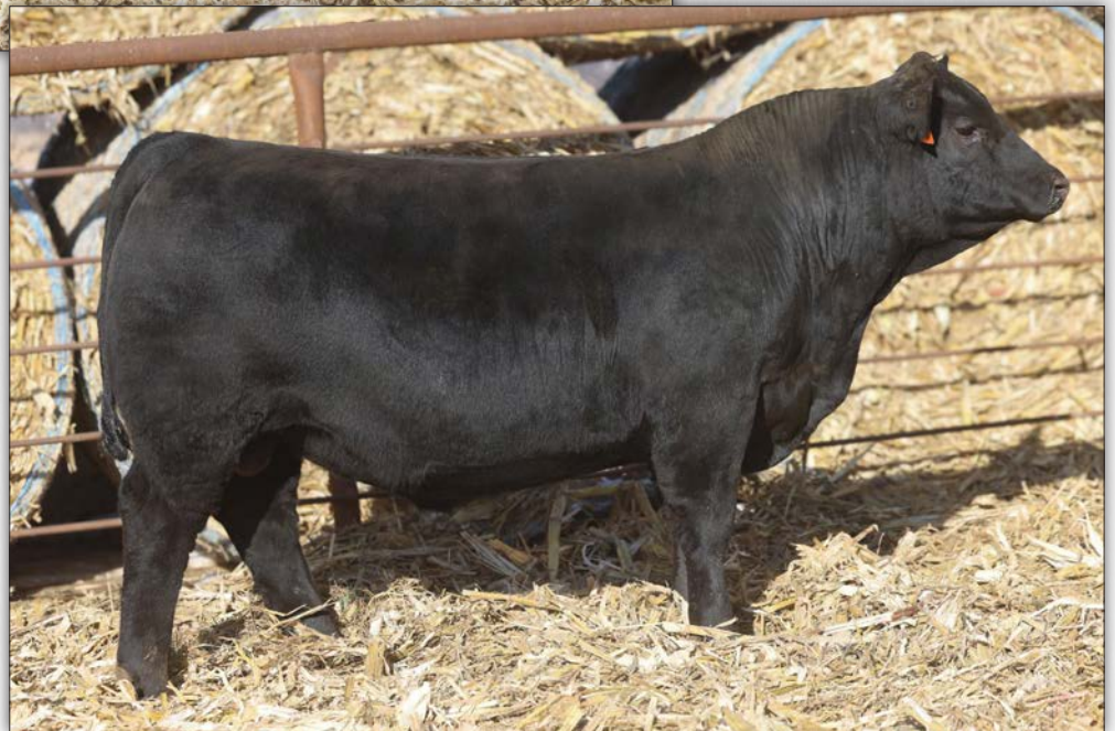
Coldwater Crk Symmetry 459