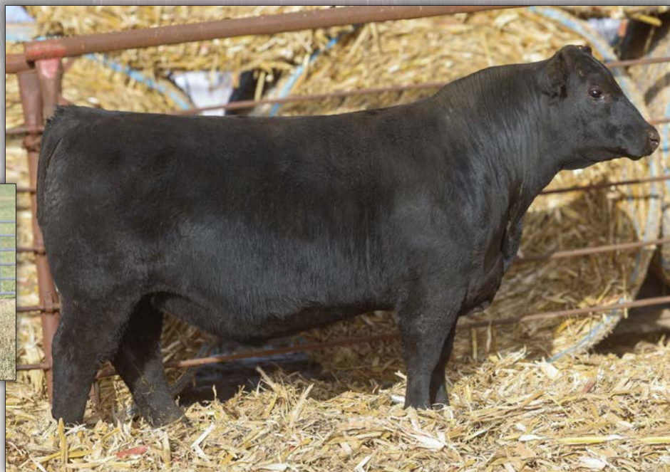
Coldwater Crk Foxhound 501