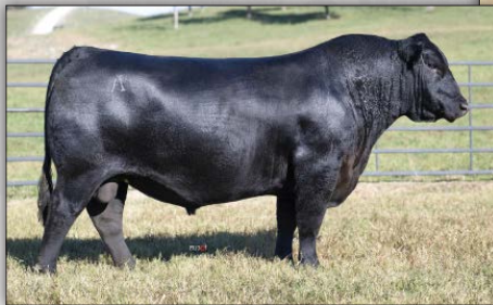
Ingram Foxhound 2501 - Sire of Lot 11-13