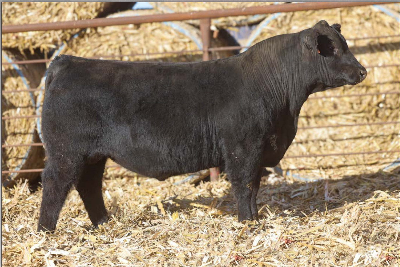
Coldwater Crk C5 504