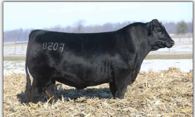
Woodhill Patent - PGS to Lots 23-25

• Ranks in the top 2% for RE; top 10% for RADG and FAT; top 15% for $B; top 20% for DMI and MILK.