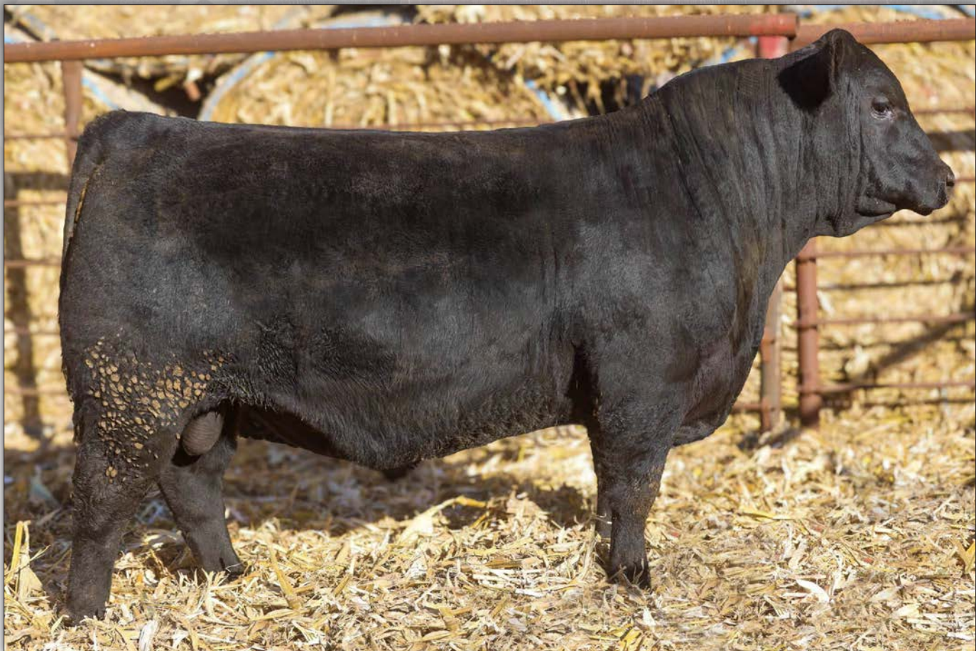
Coldwater Ctrk Foxhound 461