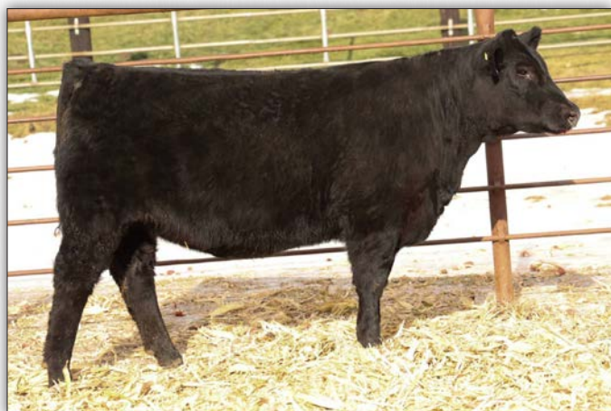
Emmy Grp Blackcap N03

• Ranks in the top 1% for WW and YW; top 4% for CW; top 10% for MARB, $B and $C.