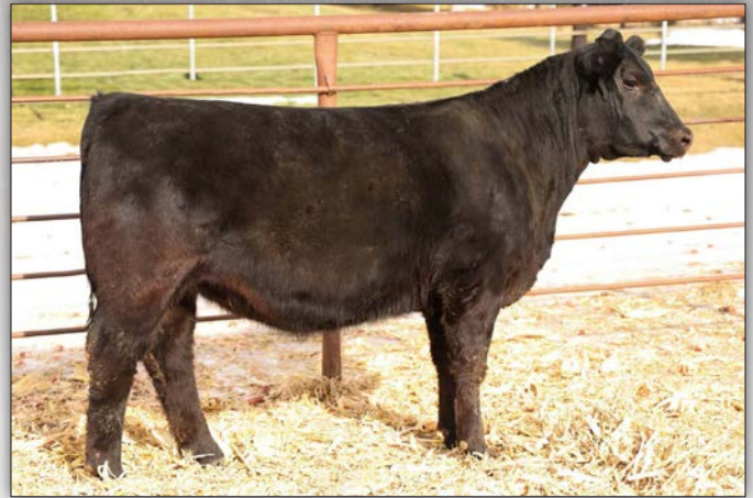
Meadow Lawn Barb 441-4107