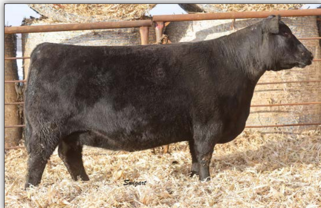
EXAR Joy 7064

Selling an IVF flush. Guarantee of 6 embryos. This phenotype standout was purchased by our partner and friends at Six Springs Farms.