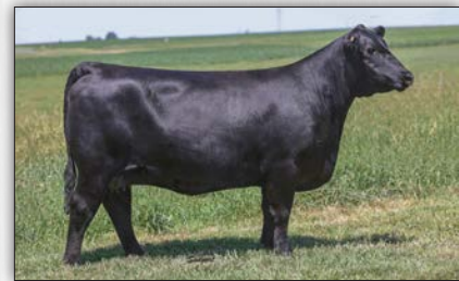
Ingram Erica H11- Dam of Ingram Foxhound 2501