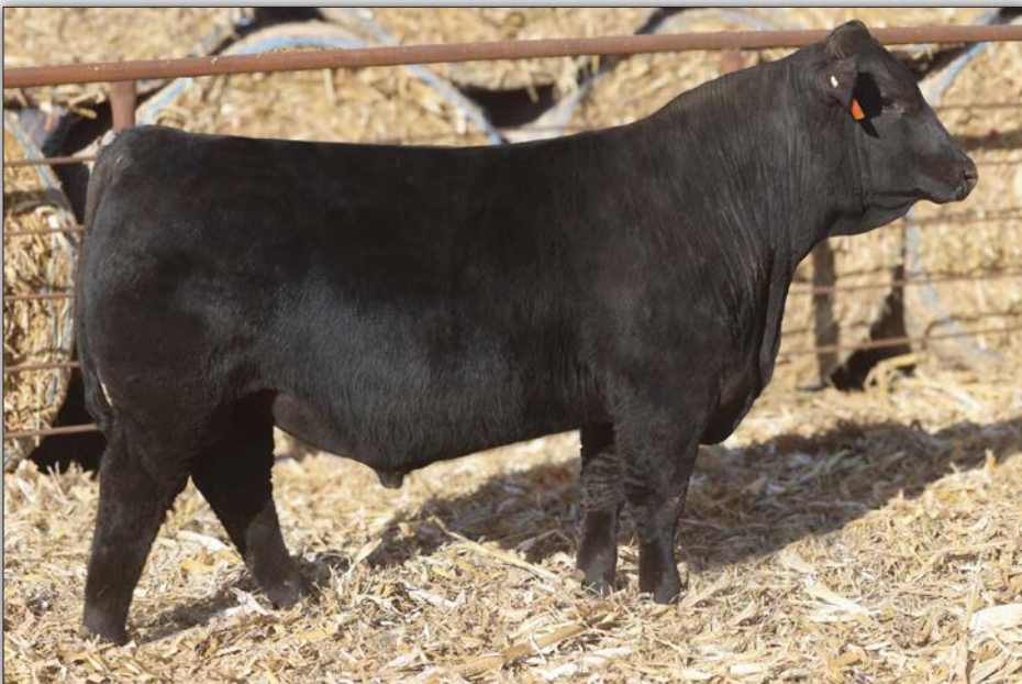
Coldwater Crk Red State 450