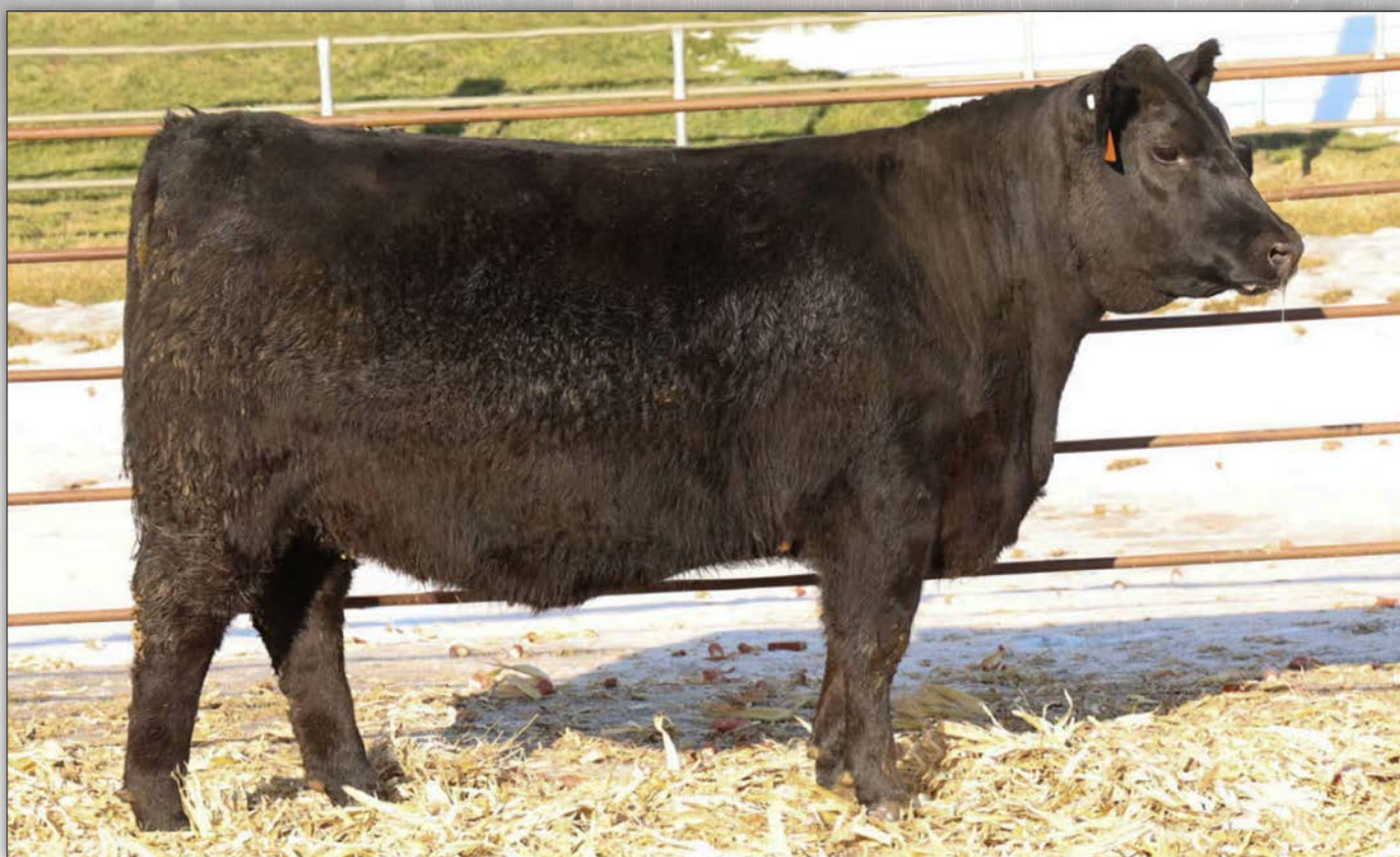
Coldwater Crk Ella 457