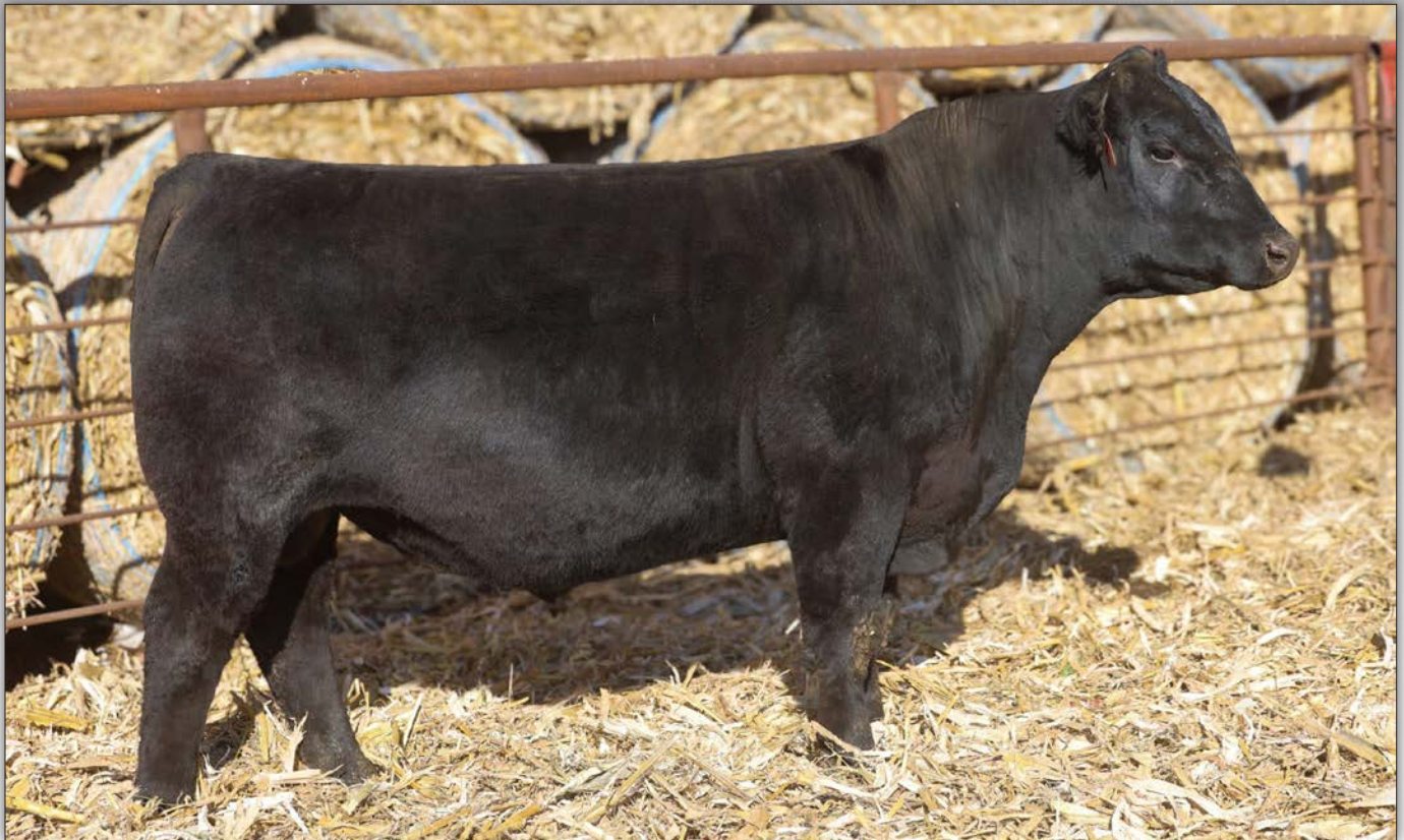
Coldwater Crk Feat 427