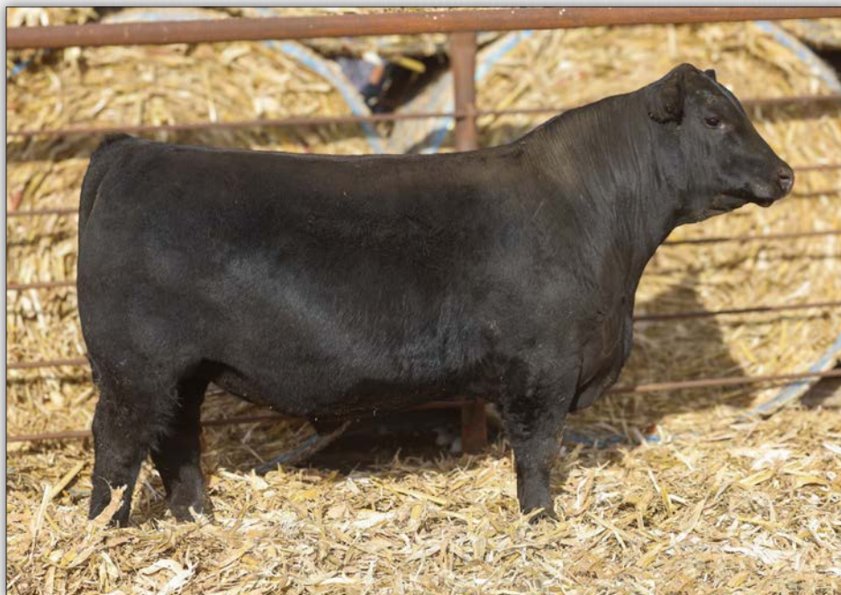
Coldwater Crk Foxhound 508