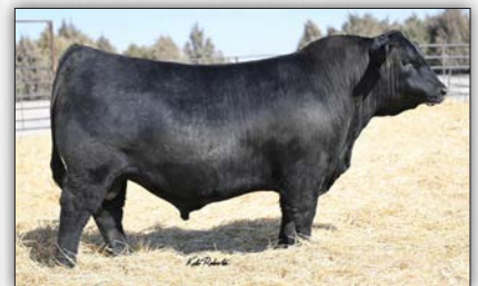
Pine View Red State - Sire of Lot 8