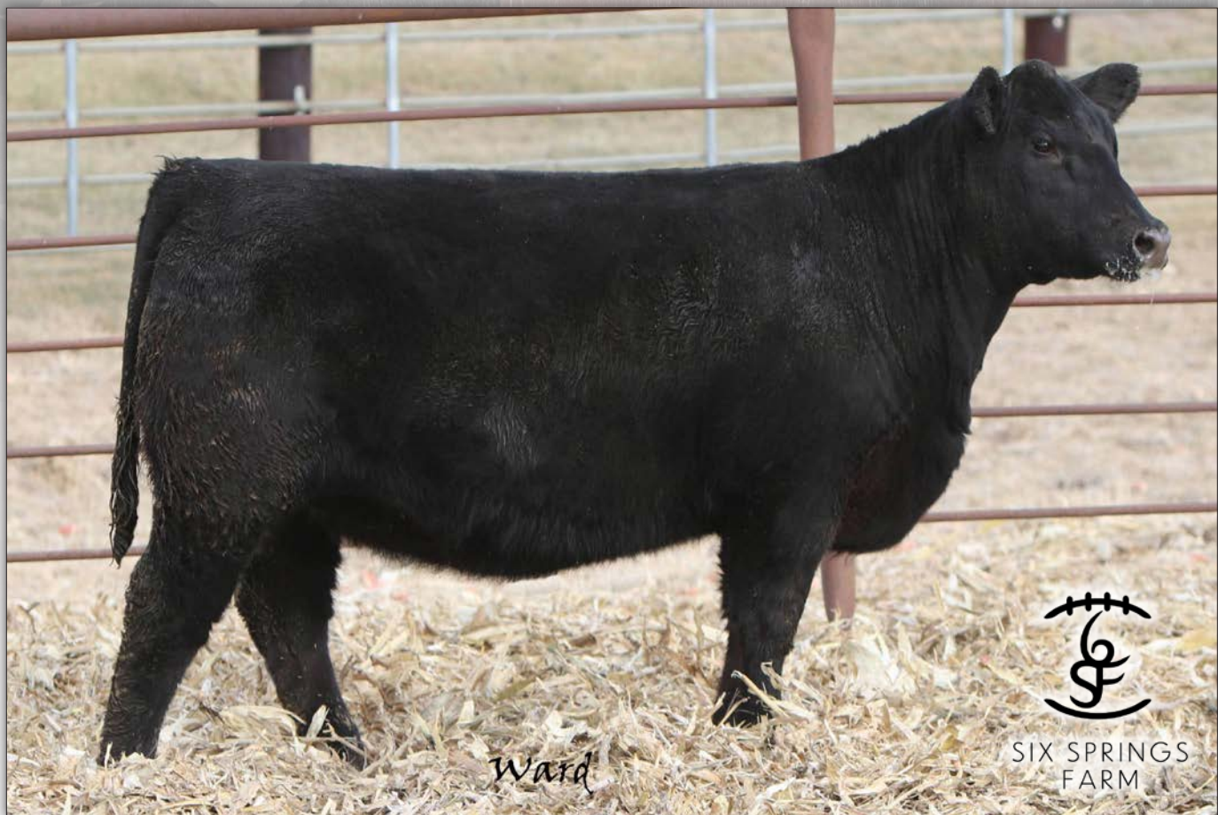
Meadow Lawn Joy 7064-3106