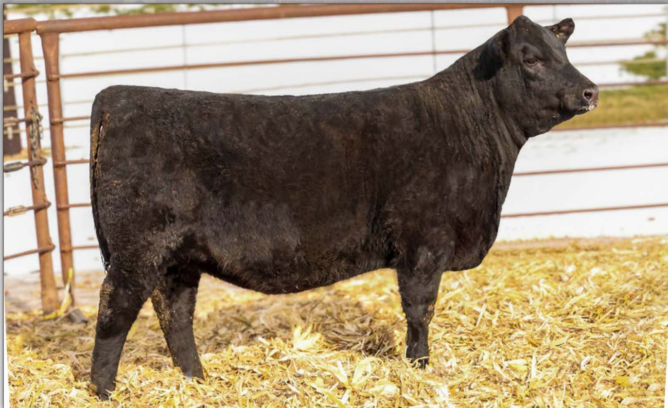
Emmy Grp Lady Bougie N01