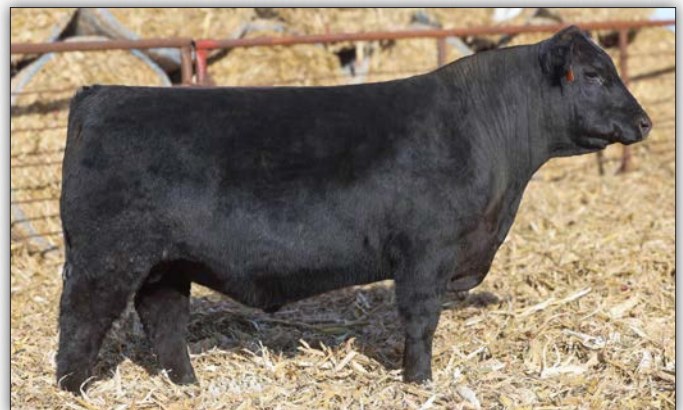
Coldwater Crk Feat 509