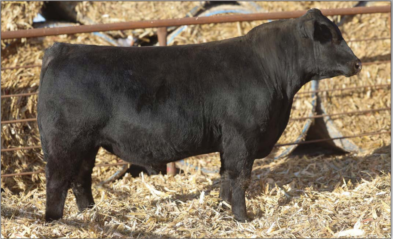
Meadow Lawn Diamond 430