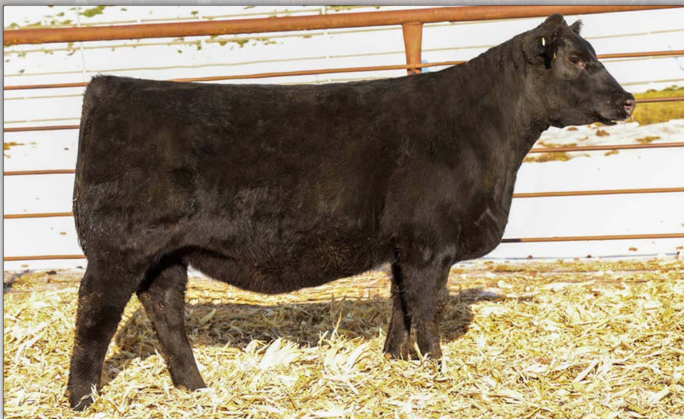
Emmy Grp Ellunamere M11