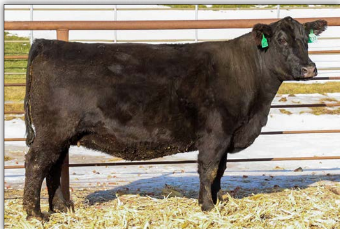
EG/MLA Blackcap G106-1033