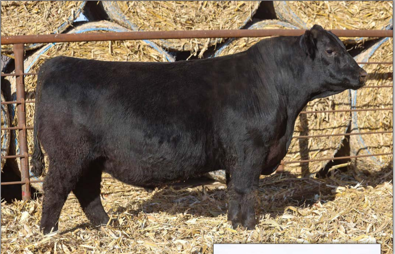
Meadow Lawn Teton 416