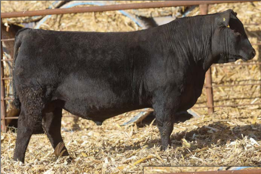
Emmy Grp Symmetry N02