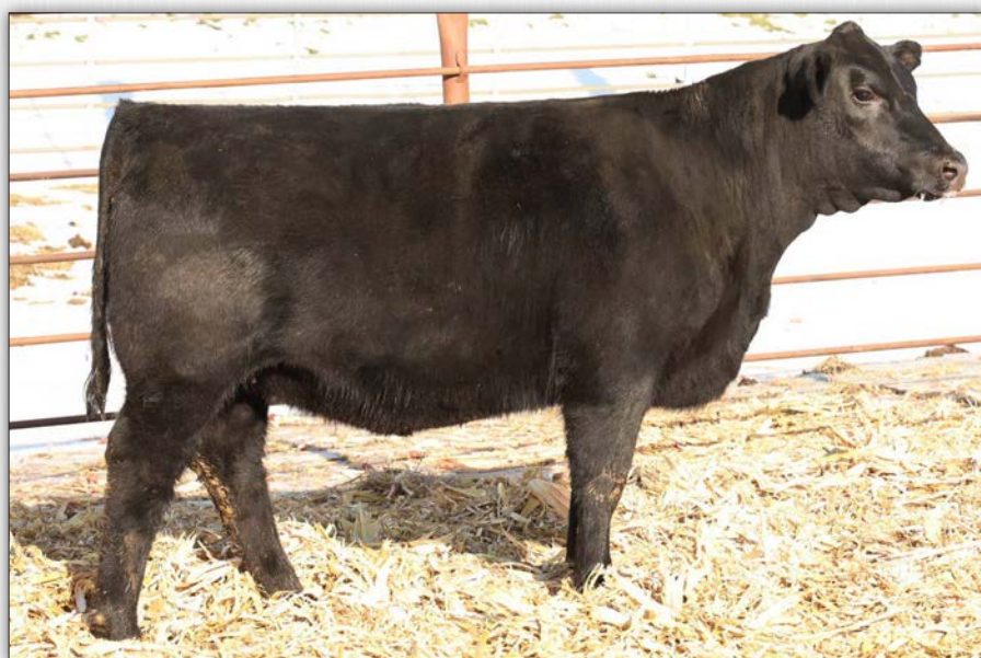
Meadow Lawn RitoJet 4127

Another pair of quality late fall heifers that we held to breed for spring. Very complete daughters of KM Blue Diamond, the Sitz Stellar son working for both programs here at Meadow Lawn and Emmy Group. These are the heifers to invest in; you will make money each year when the calves come in at weaning.