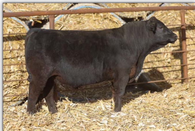
Meadow Lawn Foxhound 4101