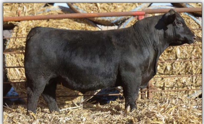
Meadow Lawn Heartland 425