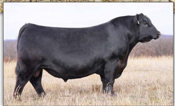
Long Teton 107 - Sire of Lot 14