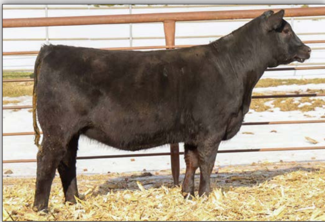
MeadowLawn LadyCat 8209-4105