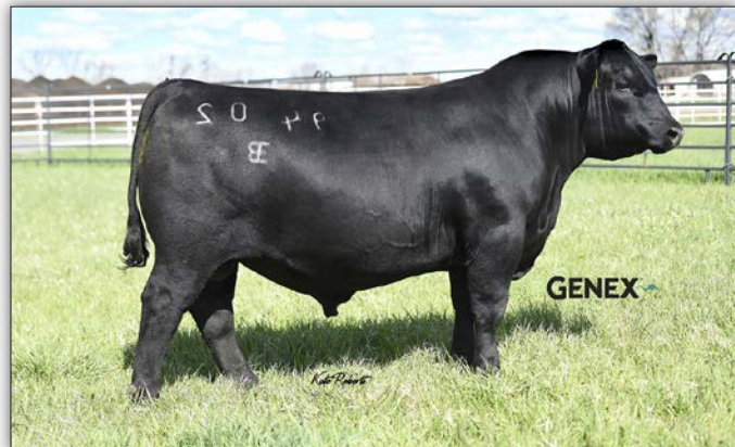
E & B Wildcat 9402 - Sire of Lot 10

• Ranks in the top 1% for WW; top 3% for YW; top 4% for CW; top 5% for $C; top 10% for MARB, $W and $B; top 15% for DOC and SM; top 20% for SC and HP.