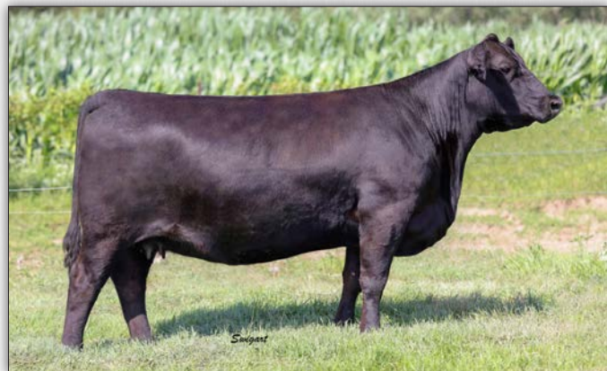
Linz Emulate Declar 614-9704

• Symmetry 228 sold in the 2022 National Finals Angus Sale for a $300,000 valuation. Since then, Symmetry has hit the Angus breed by storm where a direct daughter topped the 2024 National Finals Angus Sale selling for $250,000. Symmetry is now in the Alta Genetics lineup and is one of the top semen-selling Angus sires in 2025. His first 2 calf crops have been impressive with daughters topping sales across the country. Symmetry offers one of the breed's most impressive data profiles being in the top 1% for WW, YW, CW, RE, $F, $B, & $C.