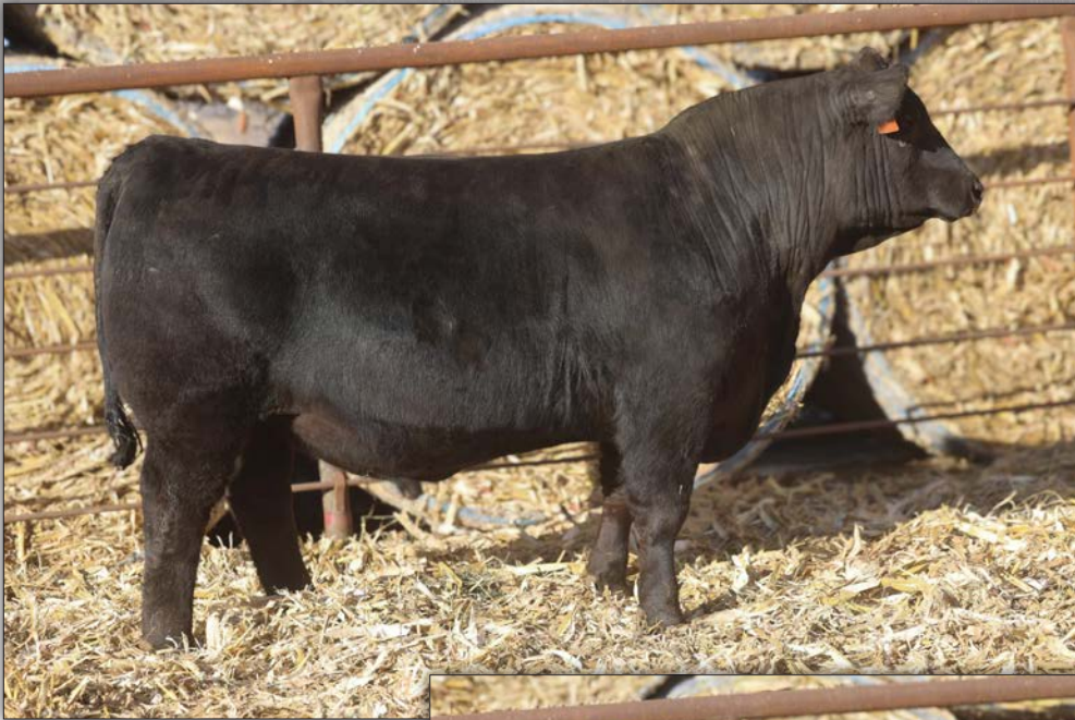
Coldwater Crk Symmetry 460