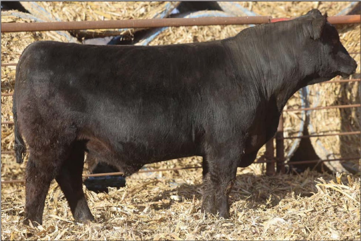
Meadow Lawn Manifest 441