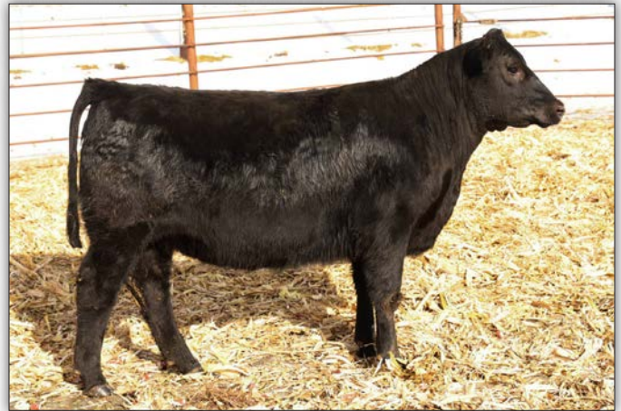
Meadow Lawn Rita 1564 512