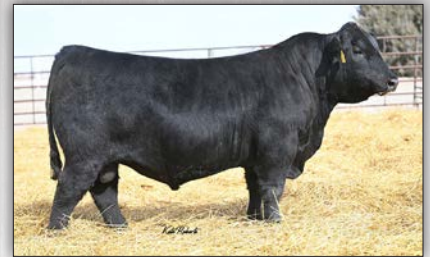
Marda Great Lakes 370 - Sire of Lot 7