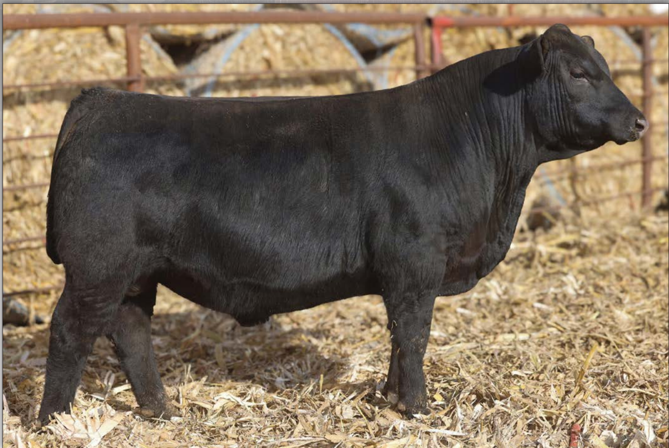
Meadow Lawn BlueDiamond 4108