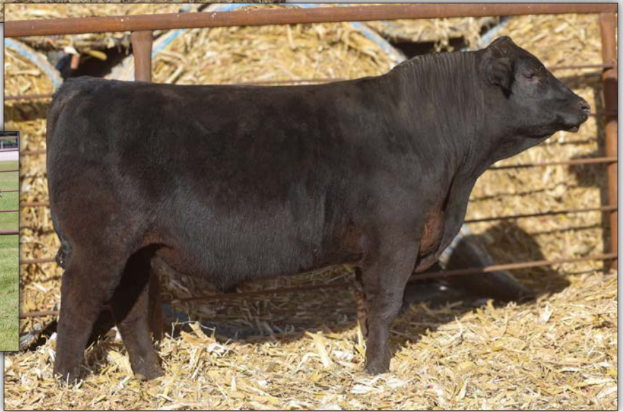
Meadow Lawn Symmetry 4104