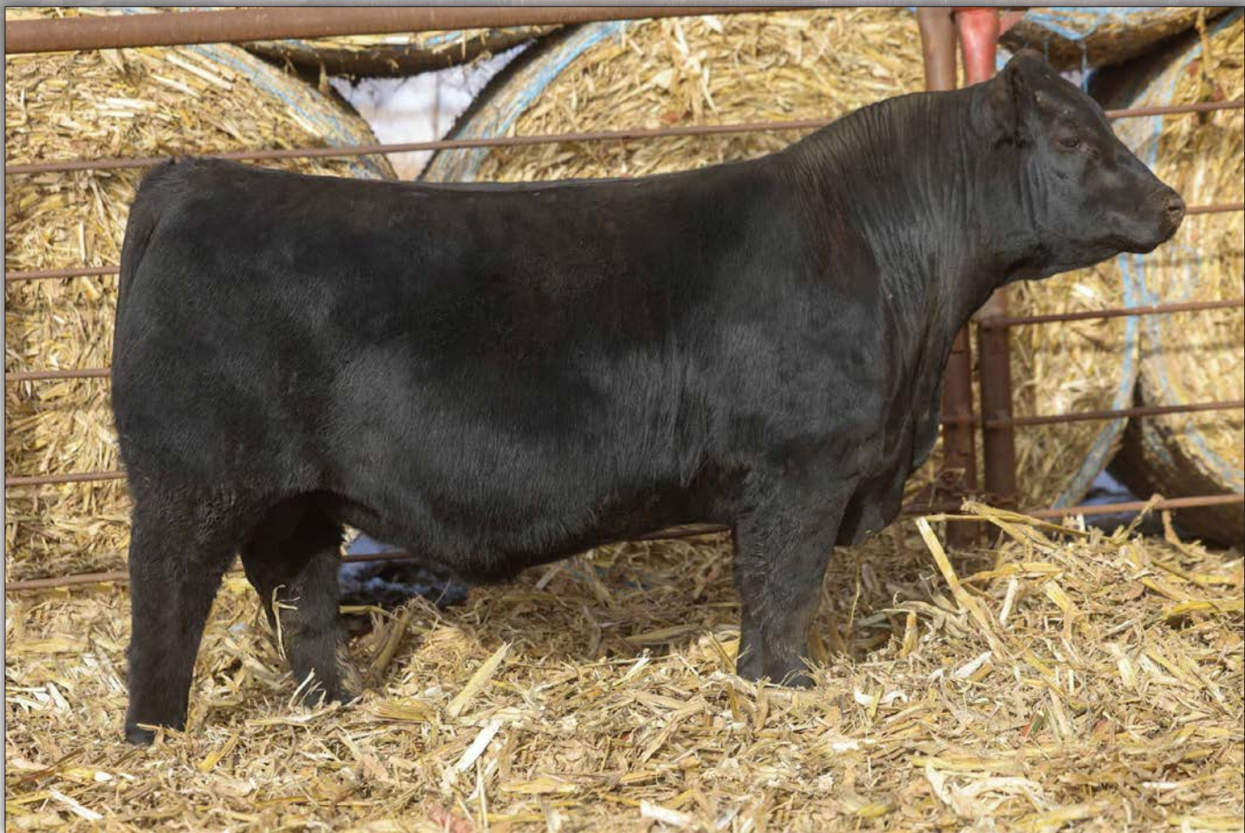
Coldwater Crk Congress 506